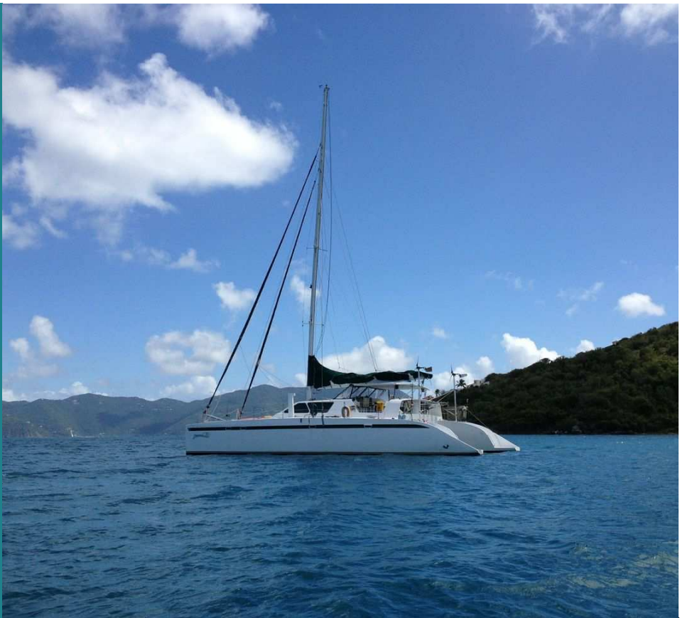
Dragonfly - Sea Mercy's Flagship FHCC for the Kingdom of Tonga

For a full list of specs on Dragonfly, visit our website.