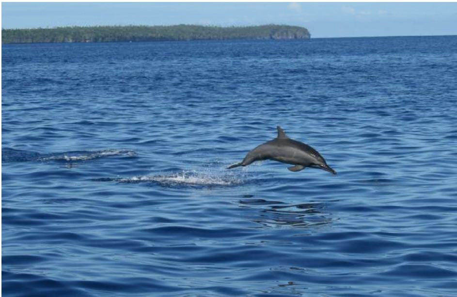
Porpoise in Tonga