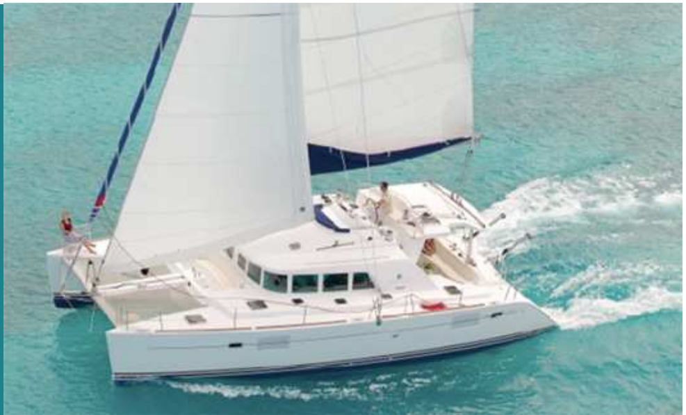
Rebelle - a 44 foot Lagoon catamaran