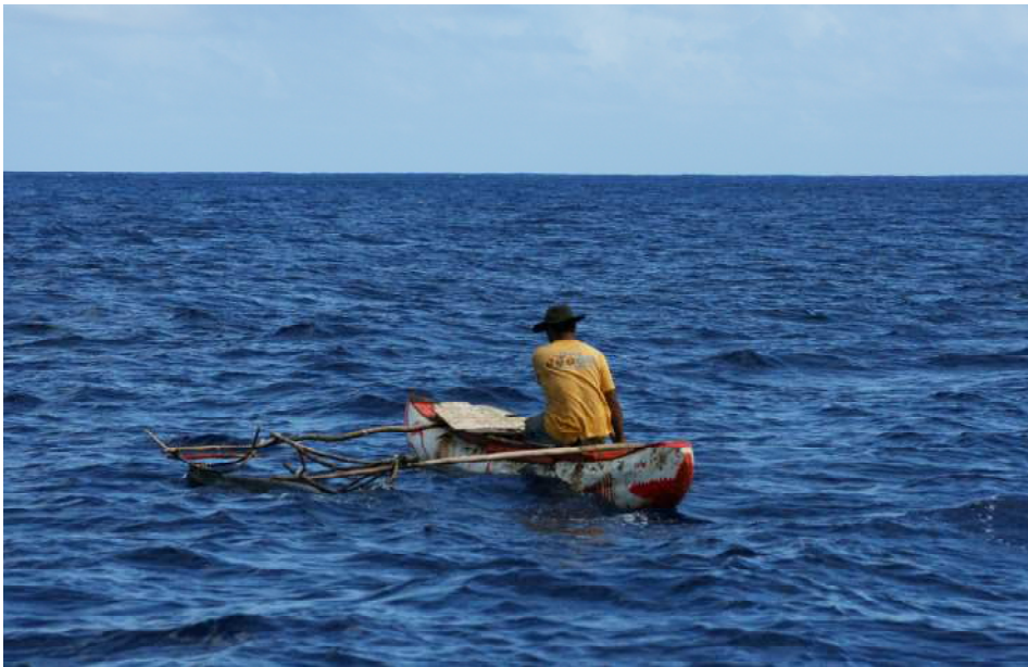
Tongan traveling between islands