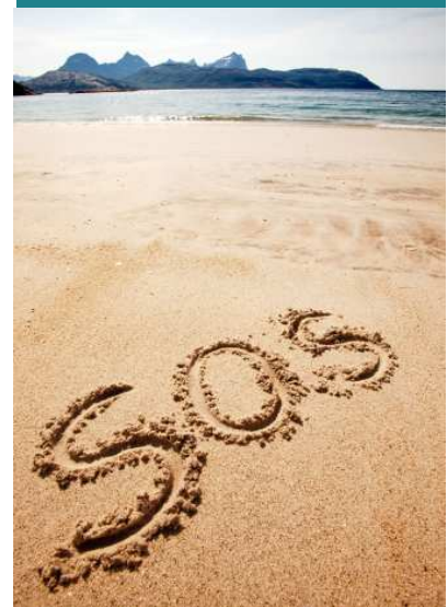
The South Pacific is calling!

We have an ever growing number of advertising partners ( SuperYachtTimes.com , CruisersForum.com , Multihulls Magazine , etc.) who have taken on the same heart and spirit to help us reach their readership and members who can contribute their talents, their goods, or their financial resources to meet the incredible needs in the South Pacific.